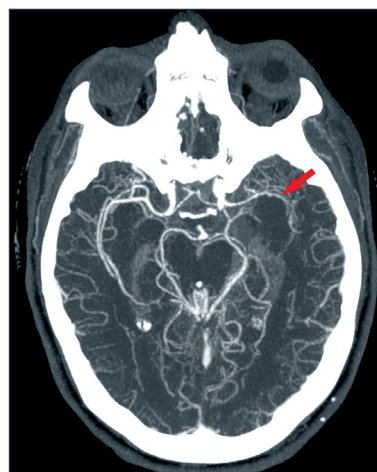
Figure 3. Angio CT-scan showing vasospasm of the left MCA (arrow).

Cerebral vasospasm after tumour resection is an uncommon complication 9 . It has been described after resection of pituitary tumours via transcranial and transsphenoidal 8,9,11-19 . So far, only 21 cases of vasospasm after TSS pituitary adenoma removal have been reported, and the most of them were operated in the microscopic era. We present a case of cerebral vasospasm after pituitary adenoma resection via