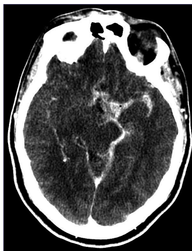
Figure 2. Postoperative CT scan showed SAH filling basal cisterns.

The patient underwent an endoscopic, endonasal expanded transsphenoidal, transtuberculum approach for removal of the tumour. A macroscopic total resection of the sellar and suprasellar component was achieved, leaving a rest of tumour in both cavernous sinuses as planned. As a unique intraoperative incidence, an important venous bleeding was observed during resection of the suprasellar component, which was controlled with pressure and haemostatic materials. A multilayer reconstruction with synthetic materials was done, achieving a hermetic closure. A lumbar drainage was placed in order to prevent postoperative CSF leak. Postoperative CT scan showed a significant amount of blood in the subarachnoid space filling the basal cisterns, involving the left suprasellar, sylvian, ambiens and prepontine cisterns (Figure 2). There was no evidence of ventricular dilatation.