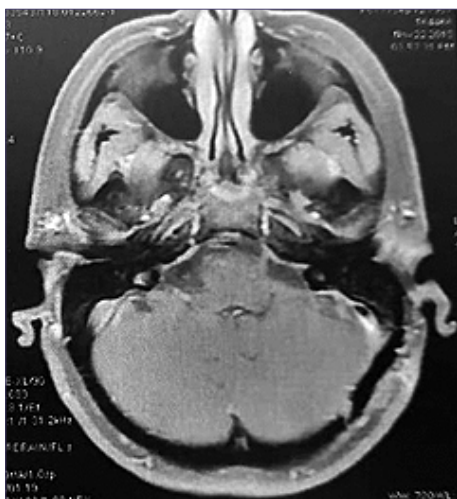
Figure 3. Post-operative axial MRI showing complete removal of the tumor.

hypoesthesia on the left face. In the 2 nd month follow up , facial nerve function had improved to HB II/VI.